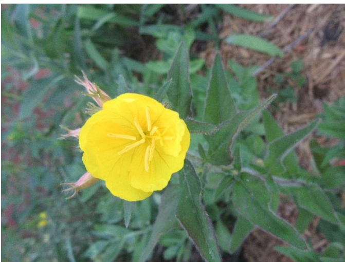
Evening Primrose, Oenothera fruticosa