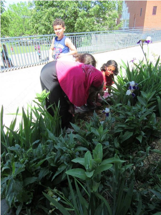
Second graders found a butterfly in the garden.

The Monarchs have arrived. Students observed what appears to be a monarch egg on the underside of a milkweed leaf. A wide variety of insects feed on milkweed and goldenrod. Evening Primrose ( Oenothera Fruticosa ) puts on a show. And monarchs can be seen fluttering around the garden.