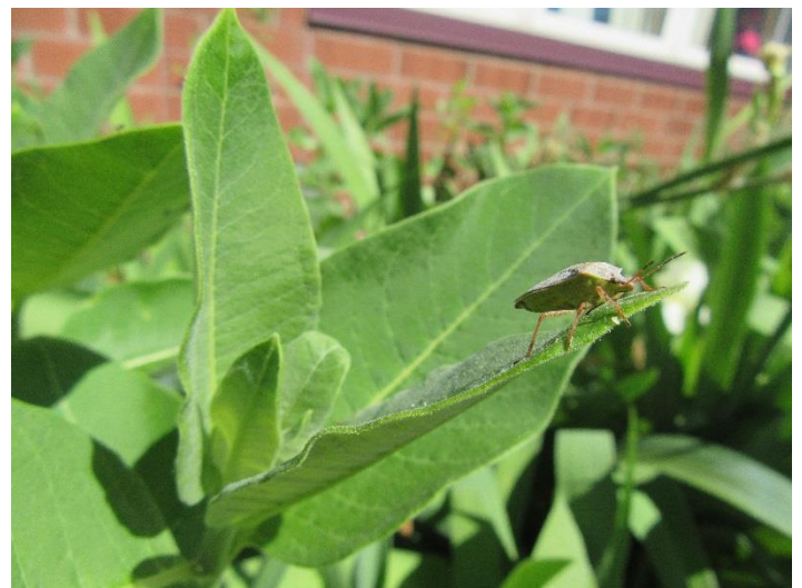
Many insect species are feeding in the garden, including this one. What kind of bug could this be?