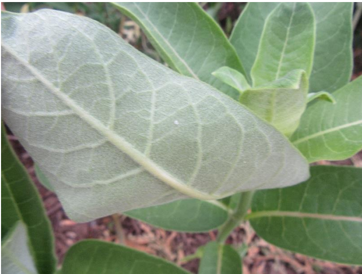
And on the underside of the milkweed leaf, a tiny white egg. Monarch????