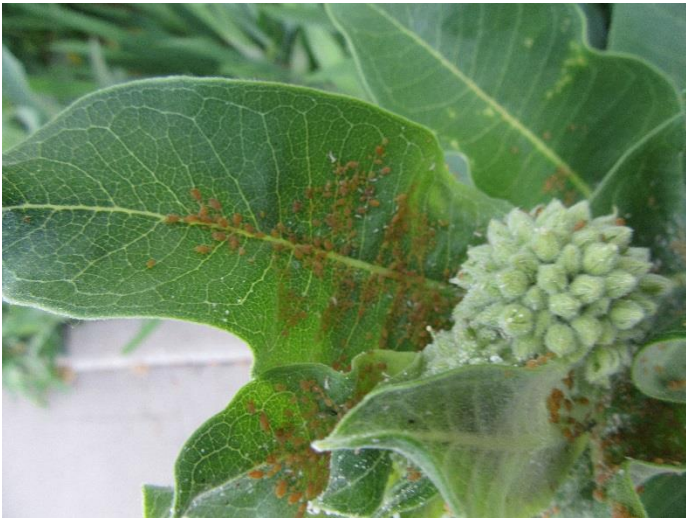
Common Milkweed, Asclepias Syriaca , plays host to many tiny eggs.