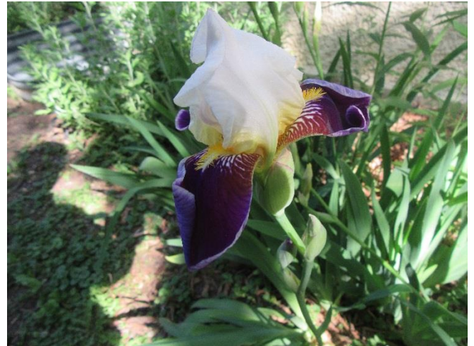
Our last week for lovely irises in bloom.